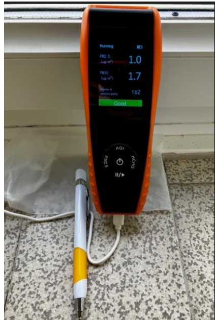
Figure 2. Commercial monitor

Information was stored in the monitor and students transferred the stored files, along with date/time of readings via cable, to their own machines. Subsequently students then loaded the data, along with location information, to the database. Only one monitor was found to be faulty although the temperature readings were misleading if the monitor had been left in direct sun. Monitors were delivered to student home addresses by standard mail systems and were packaged in an envelope that also contained a pre-paid return envelope. None arrived damaged and none were lost in the post. The monitor is shown in figure 2 with a pen shown for scale.