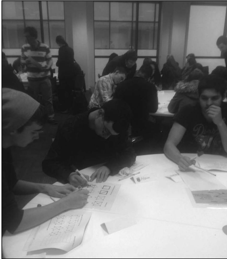
Figure 2. Pupils from different schools work together on a Graph Theory activity