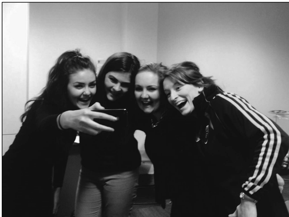
Figure 6. Group of undergraduate and postgraduate students who facilitated workshop 1

“I did not anticipate the relationship made between the students and the workshops and [I] was taken back by the attendance and involvement in all activities.”