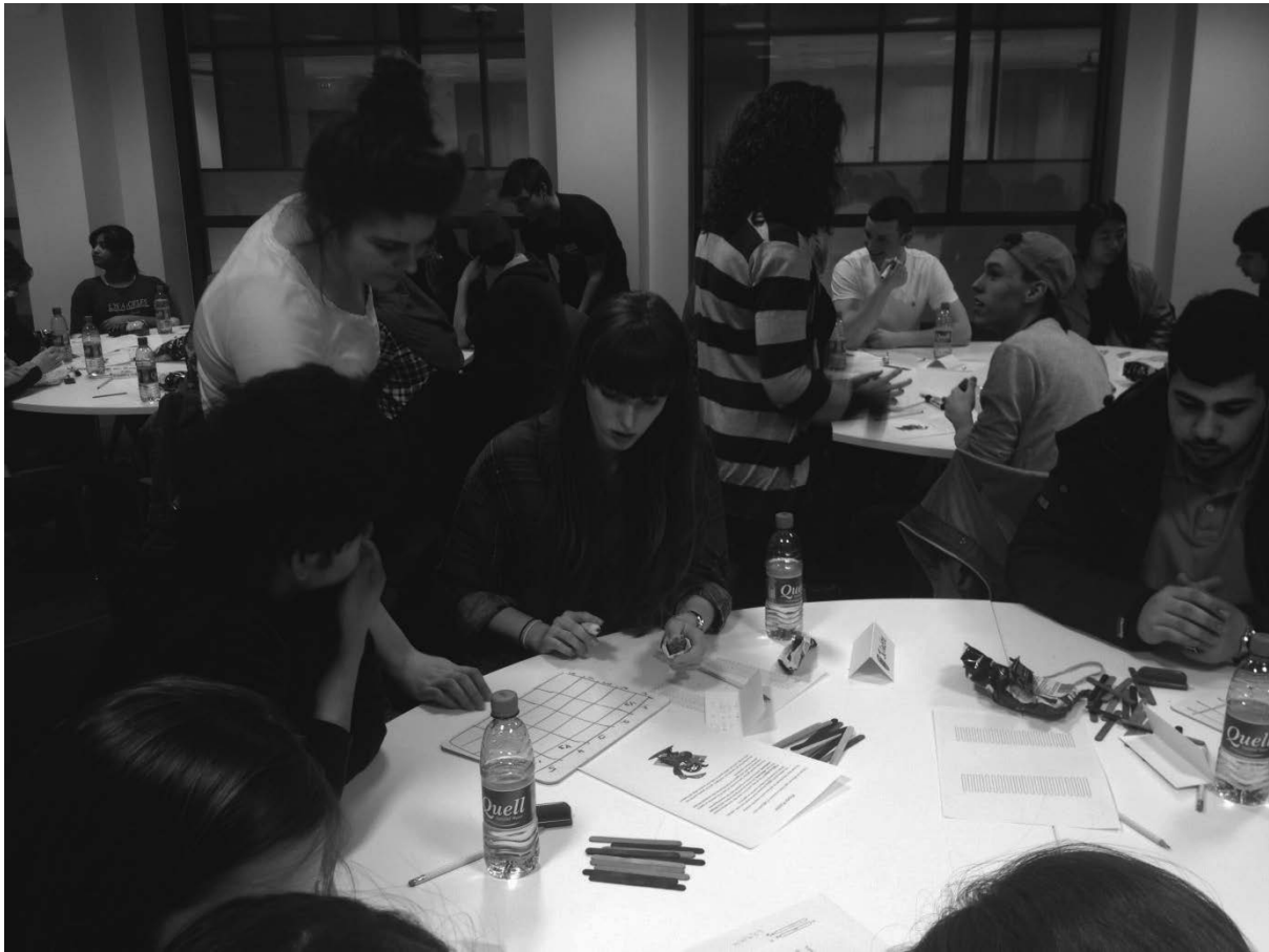
Figure 5. Pupils and students work together in attempting to solve the Pirate Puzzle

Over the four-week programme there was a marked improvement in our university students' communication and presentation skills from the first week where, "the [university] students seemed very nervous and it was hard to understand them – they talked a bit low" , to them confidently conducting and directing full workshops in weeks three and four.