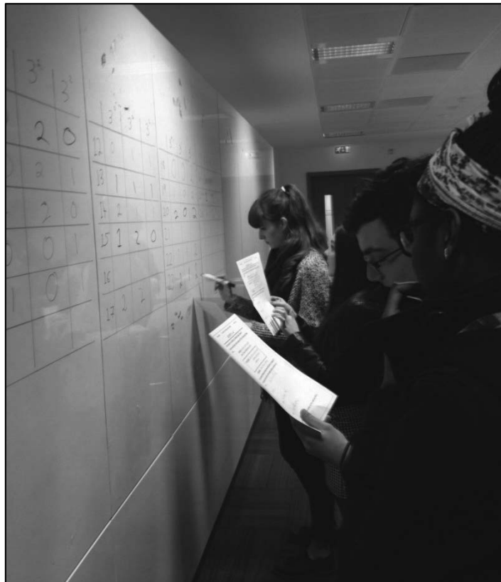
Figure 3. Pupils collaborate on calculations in base 3