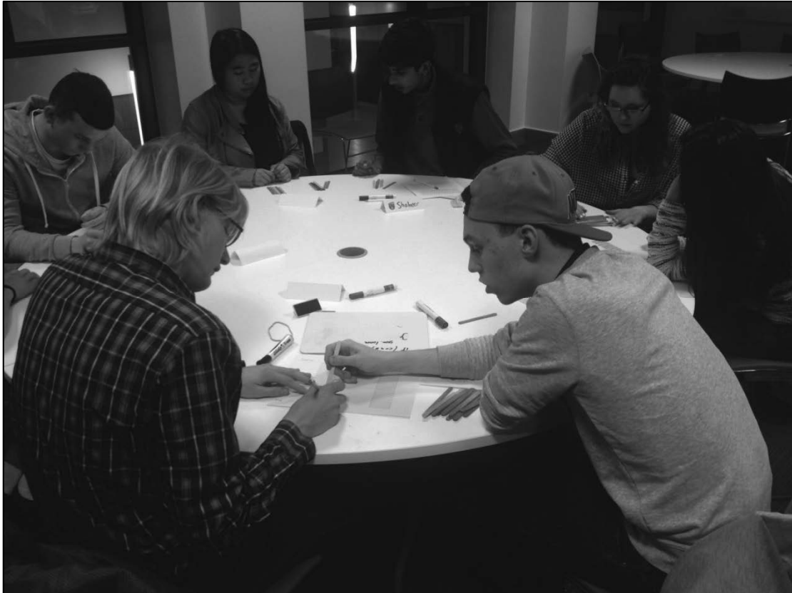
Figure 4. Pupils working out a strategy by backwards induction in the ‘Stick/Nim Game’

Pupils who had previously announced they were “no good” at mathematics began to develop their confidence in suggesting solutions as part of group and whole-class discussions and concluded that, while they might not be good at mathematics in school, they were good at this type of “ university mathematics ”. There were a small number of negative reflections where pupils noted times when they would prefer to have been given the answer without having to conjecture and trial their ideas, but the majority of them responded positively to engaging with new mathematical topics and to having their university peers as workshop facilitators.